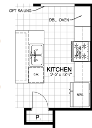
OPT. RED RIVER KITCHEN